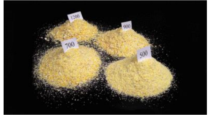
The photo above illustrates corn ground to various particle sizes

The most popular grain processing options are the hammermill and the roller mill. Hammermills are effective at grinding an array of feedstuffs and are capable of producing a wide range of particle sizes. In comparison to roller mills, hammer mills are noisier and generate more dust and heat during the grinding process, while consuming more energy.