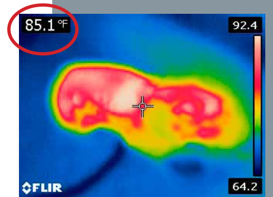
Piglet left to air-dry 30 minutes post-farrowing